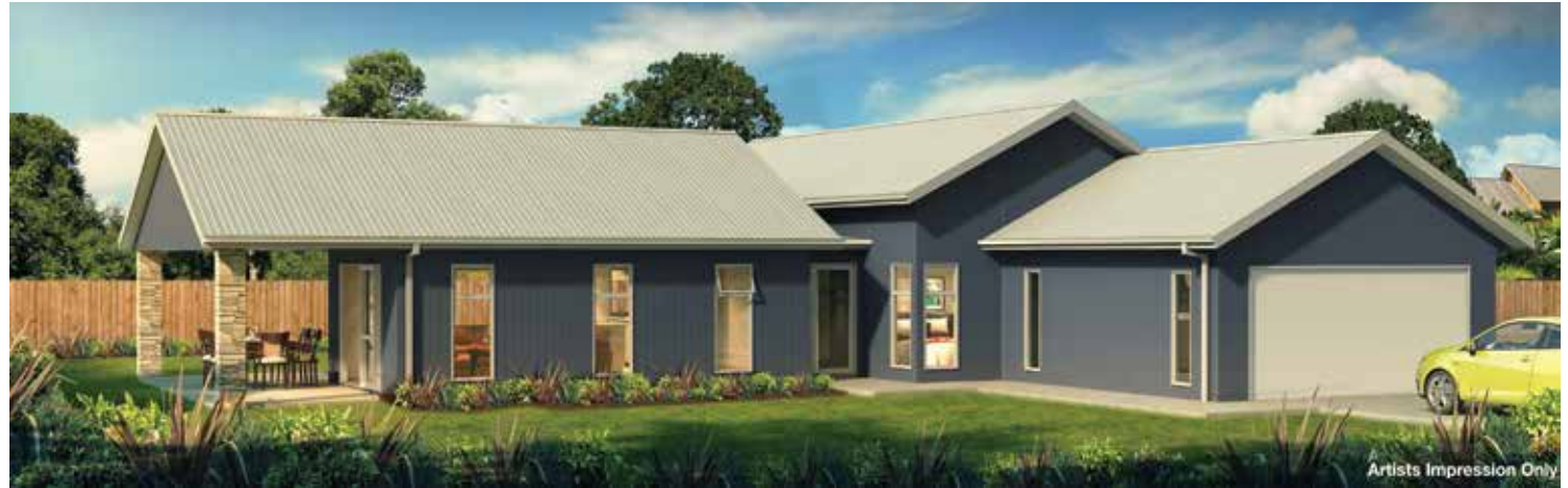
Artists Impression Only

If you enjoy good company, this home is an entertainer's dream. Stacked rooflines draw attention to the welcoming foyer. Inside, the expansive living area allows multiple options to dress and use the space to reflect your personality.