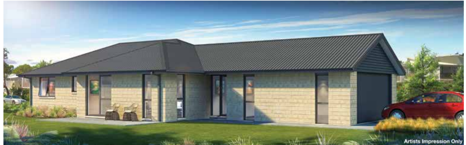
Artists Impression Only