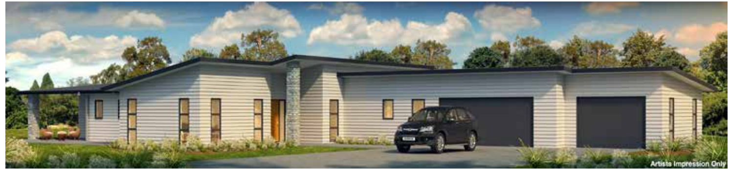
Artists Impression Only